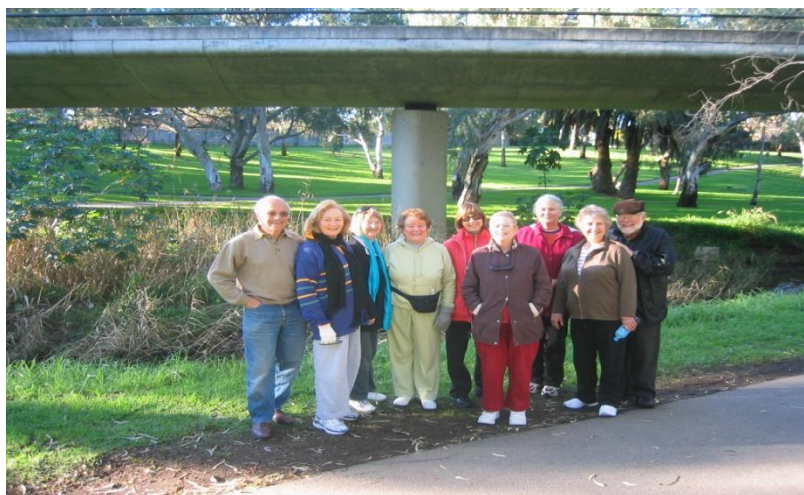
“Our Happy Band of Walkers”

“Active aging requires us to go on living life to the full no matter how differently” (Joan Chittester, “The Gift of Years”)